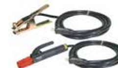
MMA KITS W000260683 W000011139