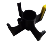
ADAPTER FOR SPOOL TYPE B300 K10158-1