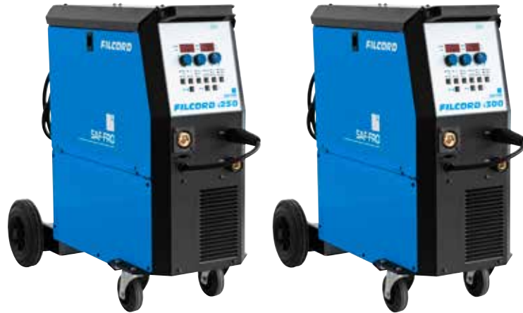
FILCORD i250 250A@35%